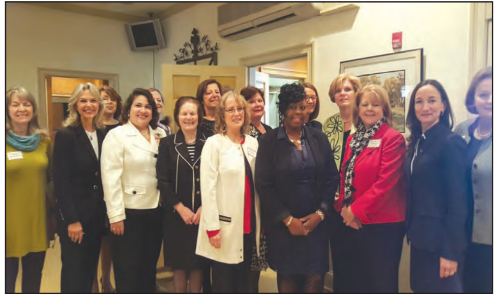
2016 Women in Business Committee.