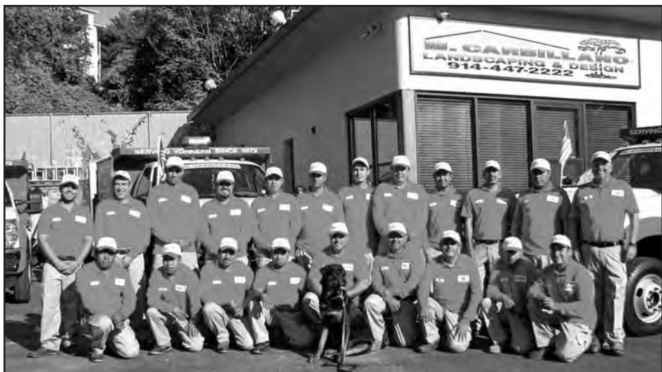
"I would like to thank my crew for their dedication and hard work"