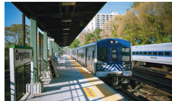
32-minutes to Midtown Manhattan via Metro-North, or a 25-minute drive on the Henry Hudson Parkway.