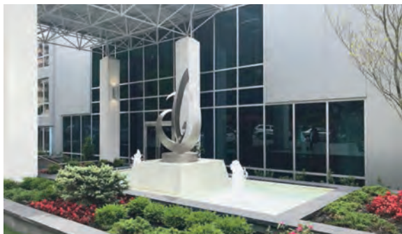
Full Service Building with 24/7 Concierge and On-Site Property Management.