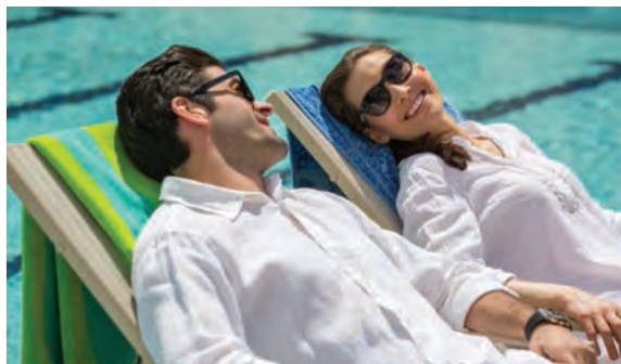
Resort Amenities including Pool & Deck, BBQ Pavilion, Fitness Center with Yoga Room, Luxurious Spa and Club Lounge.